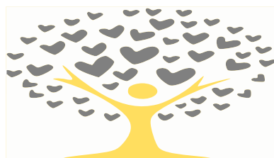
THE HAPPY AT SCHOOL PROJECT